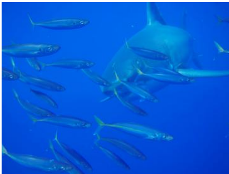
The Great White Shark, near Guadalupe Island Mexico.