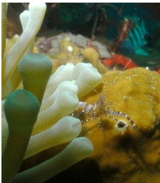
Spider shrimp taken near Lynn's reef in Florida