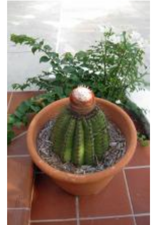
Turk head cactus and island namesake

On balance, it was a beautiful trip and one we may do again—